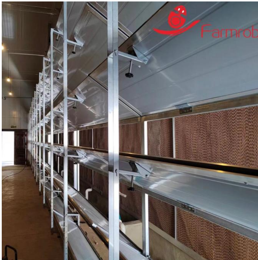
3.The air guide plates are made of 30/50mm insulated panels with an aluminum alloy frame.